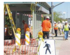
Getting ready for December.