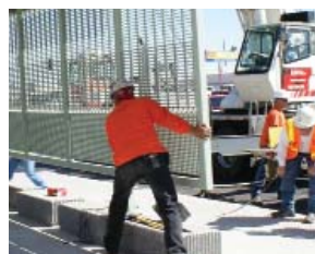
The shelter is delivered on a flatbed trailer, lifted off by a crane & set on the prepared concrete pad.

Construction is complete on five of the twenty shelters being installed at Broadway/Country Club Drive, Southern/Country Club Drive, Juanita/Country Club Drive, San Angelo/Country Club Drive and Elliot/Arizona Avenue. These are being installed to prepare for the December launch of the Arizona Avenue LINK. The 12 ft. by 44 ft. shelters were fully assembled at a local fabricating shop prior to installation to help save on construction time and reduce the impact to local pedestrian and vehicle traffic.