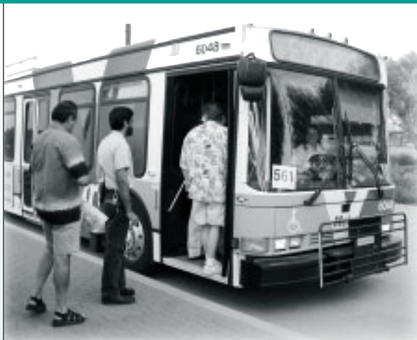
Since 2000, ridership on Valley Metro buses has increased 35 percent.