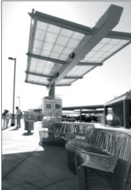
The new vehicle management system will soon send real-time bus arrival messages to electronic signs at RAPID stations.

Valley Metro buses have been equipped with satellite technology and modern communications equipment. Together, they constitute the