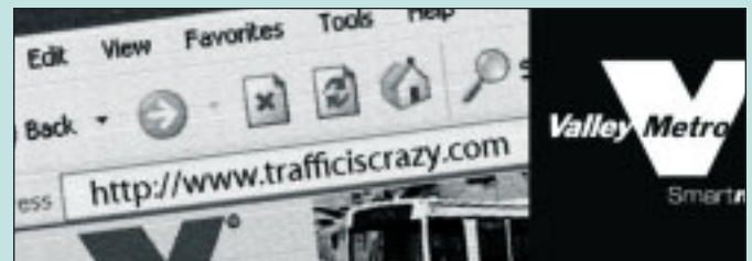
A new print ad promoting the Online Trip Planner will be featured in local publications.

The number of new, regular, and visiting bus riders who have taken the time to provide feedback on the new service speaks to its success. "I am very impressed!" wrote a first time Valley Metro rider. "It gave me two different options that will both work very well." To see how the Online Trip Planner works, go to www.ValleyMetro.org and click on the "Custom Bus Trip Planner" link.