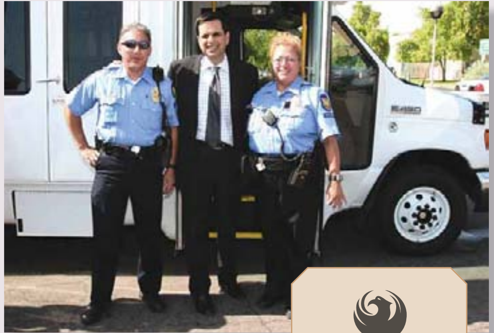
Phoenix Mayor Phil Gordon stands with two police assistants who help keep the SMART neighborhood circulator safe for passengers.

“By creating a police bureau dedicated to transit, our men and women can learn much more about challenges facing our bus operators and facility managers,” noted Tovar. “It gives us an extra boost in combating crimes like vandalism and assault where preventative measures can help diffuse a situation.”