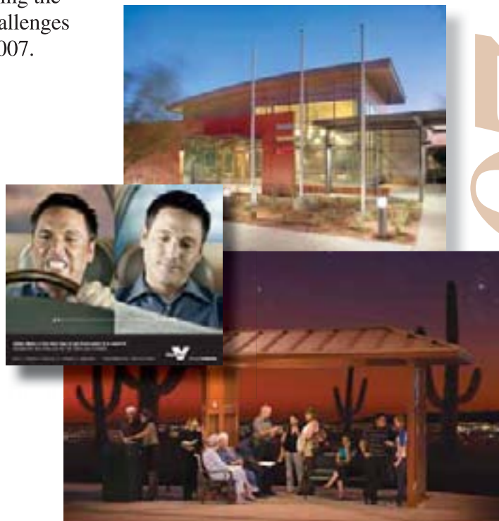
2007 accomplishments: The East Valley Bus Operations Facility, the A to B ad campaign and the Superstition Springs Park-and-Ride (top to bottom)