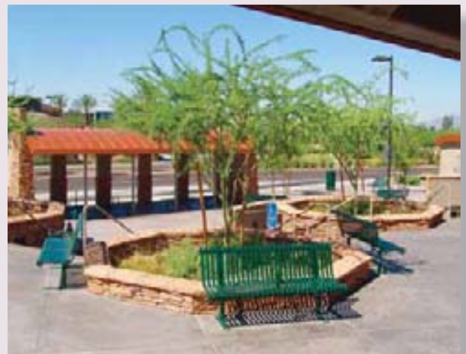
A transit center at the Chandler Fashion Center mall is one of many among improvements Chandler has made to support bus ridership

For more information about bus routes in Chandler go to ValleyMetro.org