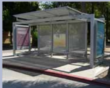
ASU Bus Canopy