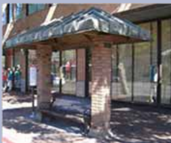
Tempe / Mill Avenue Bus