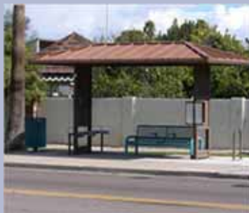
Tempe Bus Shelter