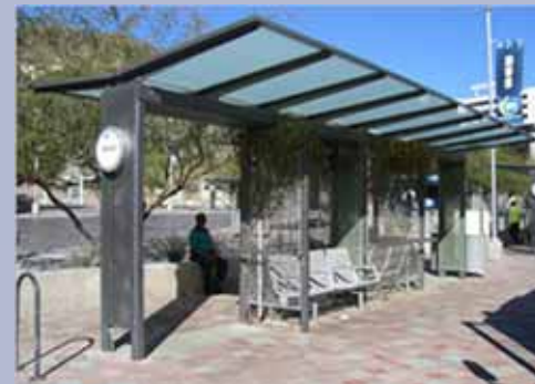
Tempe Transportation Center