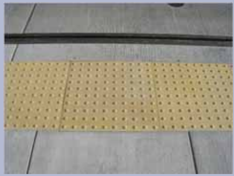
Platform Warning Strip