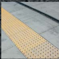
Tactile warning strip