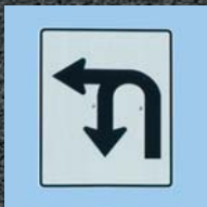
U-turns and left turns permitted with green arrow