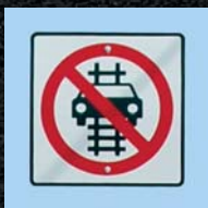
No vehicles on tracks