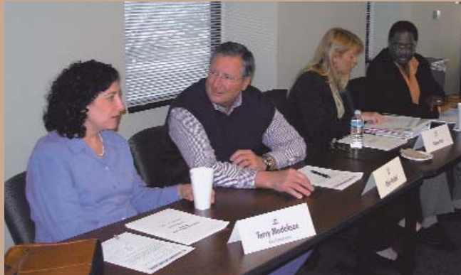
Line Section 3 Community Advisory Board

Each construction line section has a Community Advisory Board that meets every month to evaluate how well the contractor manages and minimizes impacts to the community. Board members decide whether to award the contractor a quarterly incentive for going above and beyond expectations. The Community Advisory Board is another opportunity for you to work directly with METRO and contractor staff.