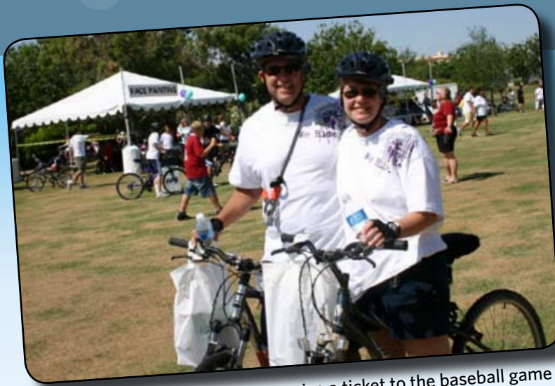
Great Bike Chase participants receive a ticket to the baseball game and a t-shirt for the ride.

This 4.3 mile fun ride is non-competitive and takes about 15 - 30 minutes to complete. Free, secure bike parking is provided.