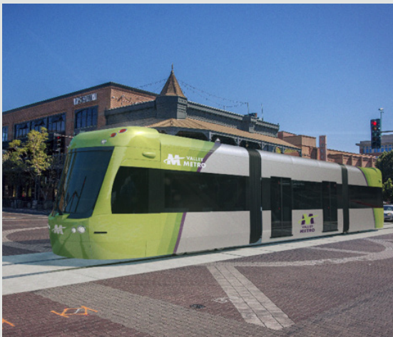
For illustrative purposes only.

Streetcar typically deploys vehicles that are smaller than light rail vehicles and operates individually, not linked together. Streetcar stops are similar to bus stops and occur more frequently than light rail stations.