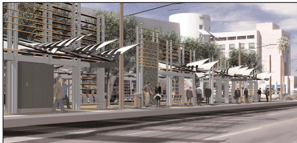
A rendering of Roosevelt St/Central Avenue Station looking north