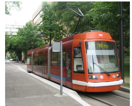
Modern Streetcar in Portland, OR

Modern Streetcar vehicles operate on tracks, typically mixed with automobile traffic, and are powered by overhead power lines. Stops are also more frequent than light rail.