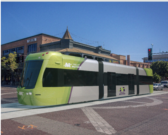
Streetcar rendering is for illustrative purposes only.

Final design plans will be complete in late 2017/early 2018. Underground utility work will begin on Mill Avenue south of University Drive in mid-September, followed by Apache Boulevard. Community outreach will continue throughout the project, including specialized business assistance programs, which will launch in Fall 2017.